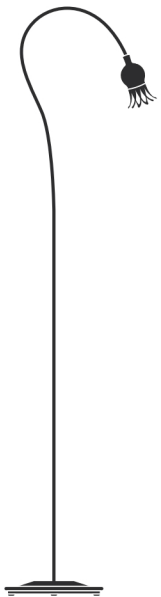
Ø 240 1 Arm